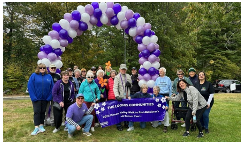
The Loomis Communities Team at the Pioneer Valley Walk to End Alzheimer's