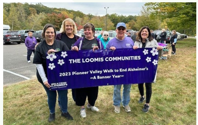
A “banner” year at the Pioneer Valley Walk to End Alzheimer's