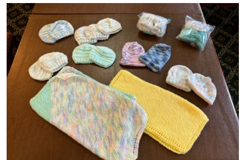
A small assortment of hand-knit baby items ready for delivery to Cooley Dickinson Hospital